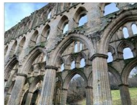
Rievaulx Abbey in North

We all have a calling placed on our lives. The primary calling is to a relationship with God: to live as a disciple, following Jesus in our daily lives. When we are baptised into the Body of Christ, the Church, we are taking our first step in response to this call, which we then have to choose to keep walking in every day of our lives.