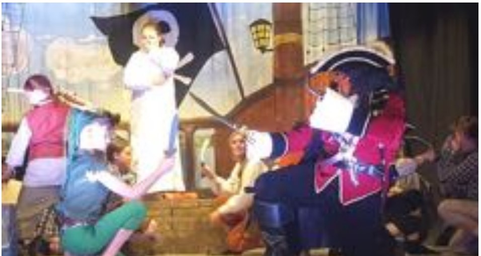
A scene from Peter Pan