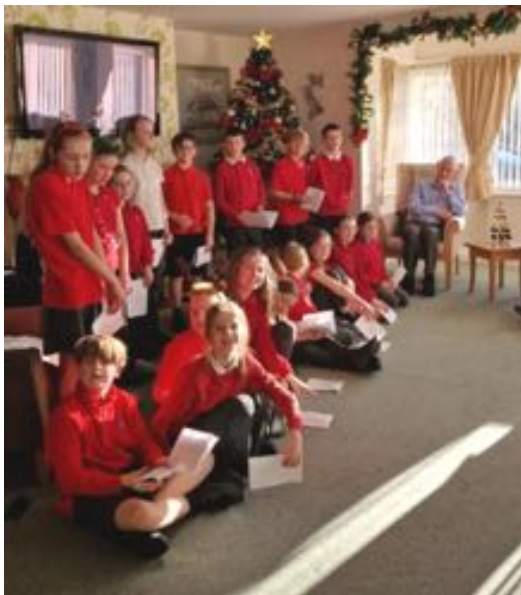
Year 6 at Bradbury House