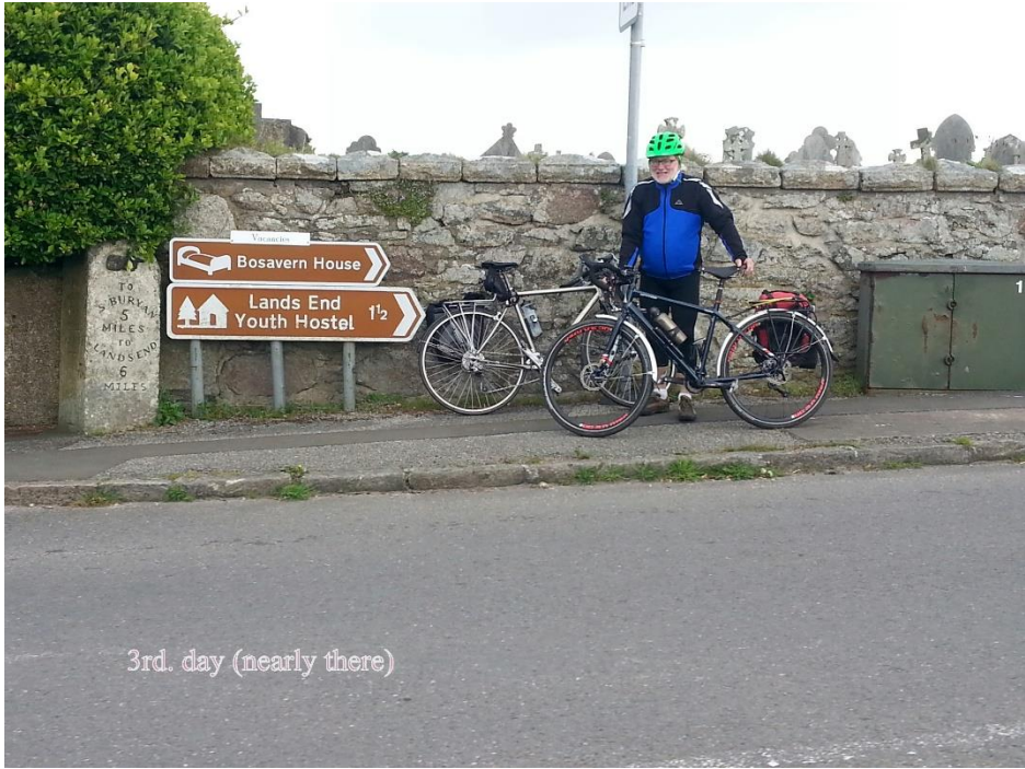
3rd. day (nearly there)