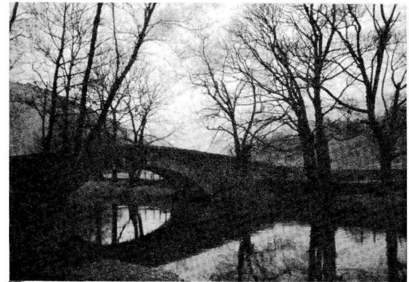
Bridge over the Langdale Beck leading to Baysbrown Farm.