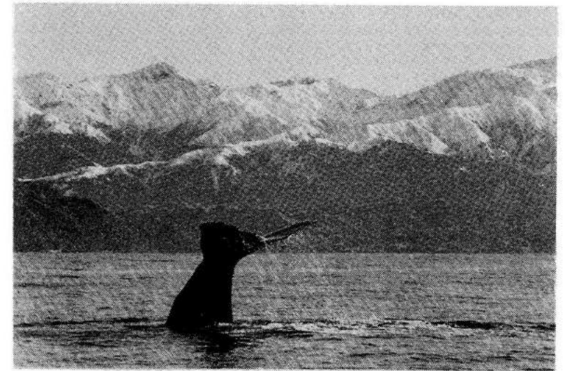
Whalewatch - Kaikoura -- New Zealand.